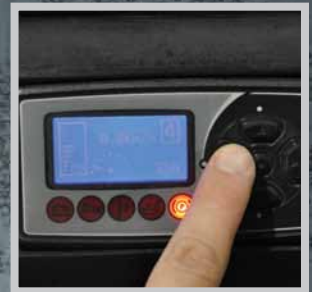
LCD DASHBOARD WITH 4 OPERATOR SPEED SETTINGS

Durable steel frame protects the hideaway rear tray and supports an I-beam channel mast for superior stability at height.