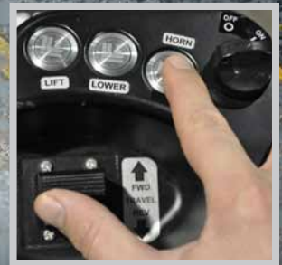
FINGERTIP ERGONOMIC CONTROLS