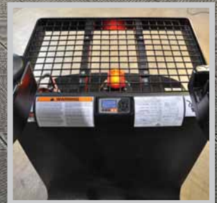
LARGE HIGH VISIBILITY OPERATORS COMPARTMENT

One piece cover provides excellent maintenance access to all drive line components